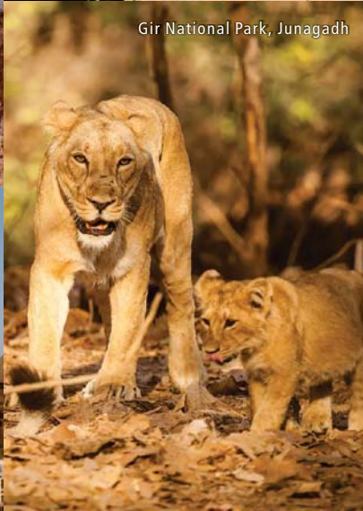
Gir National Park, Junagadh