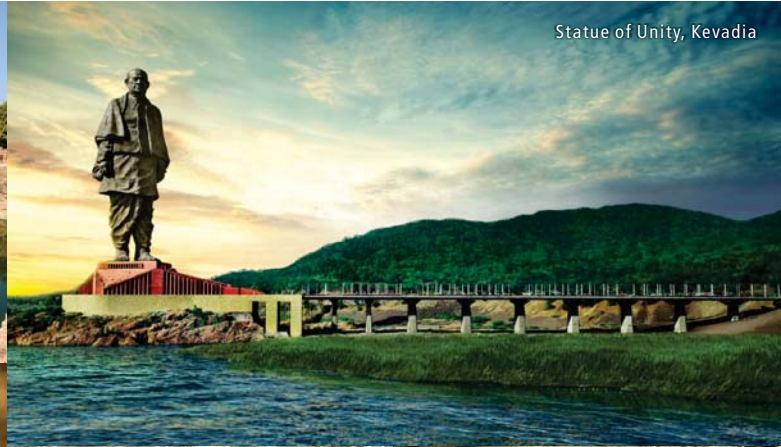
Statue of Unity, Kevadia