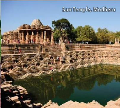
Sun Temple, Modhera